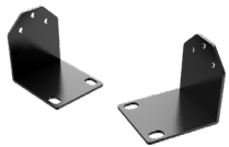
DW-G419RE 19\" data-bbox="163 814 278 838"/>