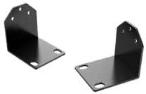
DW-G419RE 19" rack mount ears